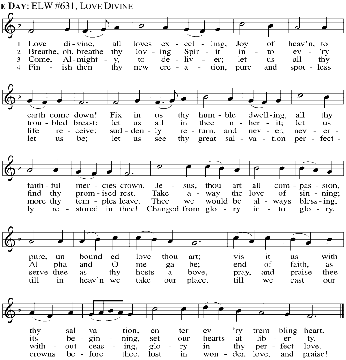
Please stand at pastor's invitation.

We confess our faith in the words of the Apostles' Creed.