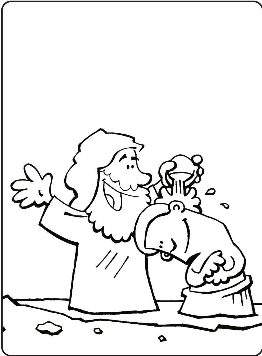
Philip baptized the man, and God's love filled the man's heart.

The Ethiopian man learned about Jesus from Philip. He promised to share the good news of Jesus. During this time, lots of people learned the good news!